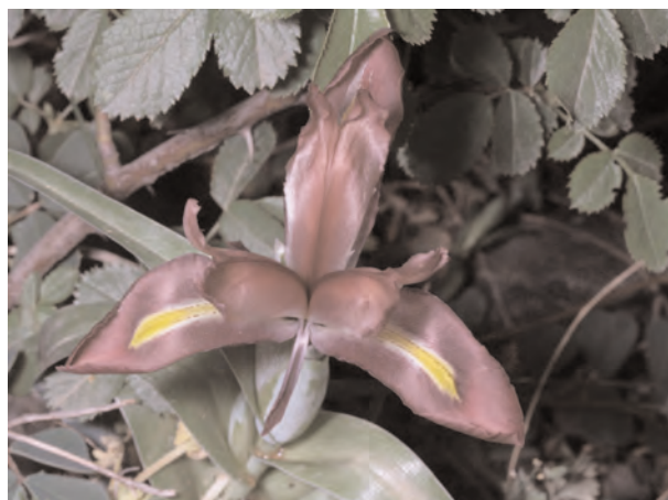
Figure 3. Iris nezahatiae Güner & H.Duman, type material (A.Güner 14024-M.Johnson, M.Öztekin, R.Unwin, P.Ravenhill), (photo by Adil Güner).

cm longa, basi 0.8-1.6 cm lata, leviter undulata, acuminata, marginibus albis, levibus vel scabrellibus, supra nitido-viridia, infra glauca et distincte et ordinate nervosa. Bracteae et bracteolae fere aequales, arcte vaginans tubo perianthorum; bracteae 4-6.2 x 1.3-1.6 cm, lanceolatae, viridis, acuminatae, ad marginem membranaceae, dorsaliter leviter carinatae; bracteolae 4.5-5.5 x 1.5-2.1, ovatae vel lanceolatae, acutae vel acuminatae, non carinatae, membranaceae margine et in dimidio inferiore. Perigonium 5.5 cm diametro, rubello-brunneum, interdum pallentior crista lutea; tubus perigoni 2.4-3.6 cm longus, interdum interne hirsutus; segmenta exteriora 3.5-4 x 1.3-1.7 cm, oblonga, ungue parum alata, linea mediana angusta, lutea, lamina 1.2-1.4 x 1.2-1.3 cm, oblonga, lamina ungue lata fere aequalis vel leviter angustior, crista c. 2.5 mm alta, undulata, lutea; segmenta interiora reflexa vel patentia, 1.5-1.7 x 0.4-0.5 cm, lanceolata, irregulariter dentata; styli 3.1-3.6 x 1-1.4 cm, rubello-brunnei margine pallentior vel albidii; stigma bilobata et retusa, 0.1-0.2 x 0.4-0.5 cm; stamina 2.1-3 cm longa, filamenta 1.3-1.9 cm longa, eburnea, anthera 1.1-1.3 cm longa, eburnea, pollen eburneum. Capsula oblongo-cylindracea, circa 2 x 1 cm, rostro circa 1 cm longo. Semina ovoidea, circa 4 mm diametro, rugosa.