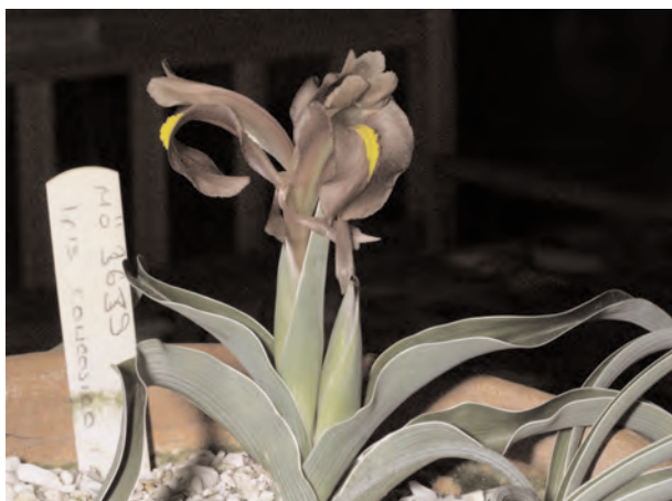
Figure 2. Iris nezahatiae Güner & H.Duman (collectors: M. Öztekin 3639-A.Güner, F. Tezcan, H.B. Güner, accession number: 2004-452B).