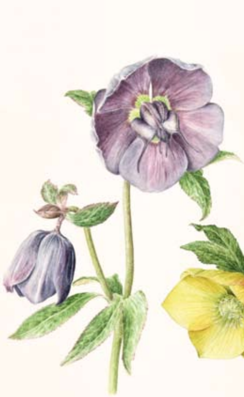
Helleborus hybridus Slate