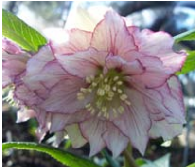
Hellebore Double Picotee - Lilac