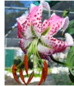
Lilium speciosum v clivorum