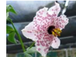
Nomocharis heavy spotting