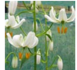
Lilium martagon v album