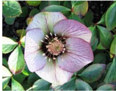
Hellebore Picotee Pink with Dark Centre