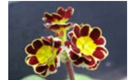
Primula gold lace hose in hose