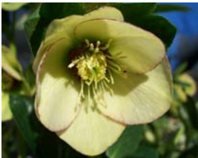
Hellebore Yellow Picotee