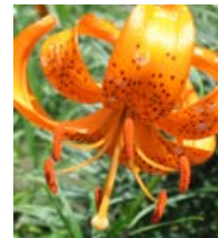
Lilium davidii v unicolor