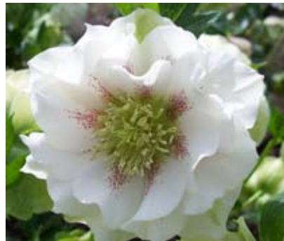
Hellebore Double White Spotted