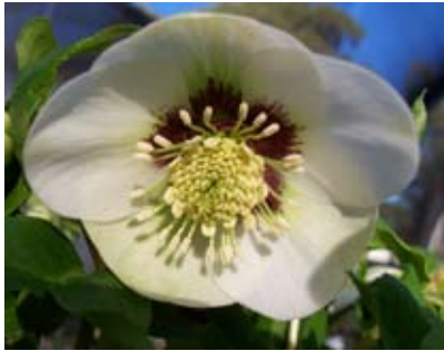
Hellebore White with Dark Centre