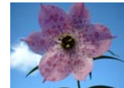
Nomocharis forrestii (aperta)