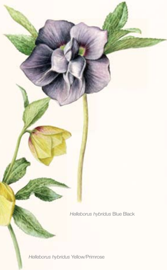
Helleborus hybridus Blue Black