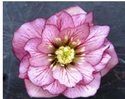
Hellebore Double Picotee - Pink