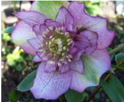
Hellebore Semi-Double Picotee Pink