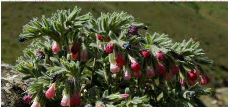
Below: Onosma alborosea